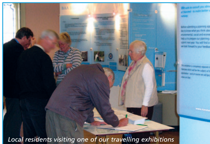
Local residents visiting one of our travelling exhibitions

As expected, a wide range of issues were raised and we are now considering these very carefully as we prepare the detail of our planning application which we intend to submit to Uttlesford District Council next year.